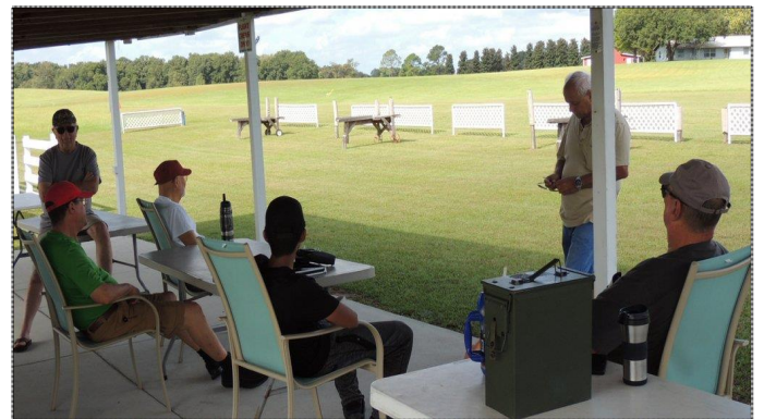
What do OWLS do when the fierce winds blow? They take shelter and shoot the breeze.