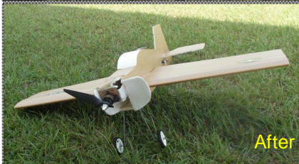
Fernando's Flite Test FT-3D crashed on maiden flight.