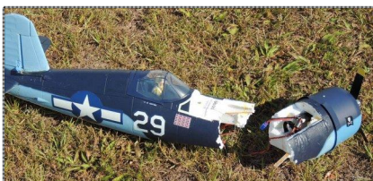
The wings were not damaged on Bill's Corsair. It's been repaired and ready for the next crash — I mean flight.