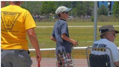
Not only jets & not only adult pilots. This young man is an outstanding pilot.