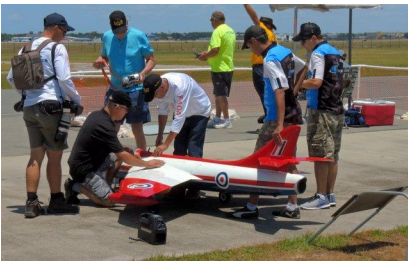
It took a team to launch this baby! Notice the exhaust deflector to protect the spectators