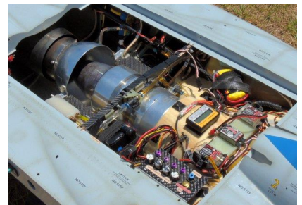
Jet engines start at a hefty $2200 up to $5k+.