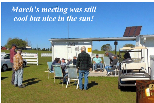
March's meeting was still cool but nice in the sun!