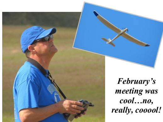
February's meeting was cool...no, really, coool!