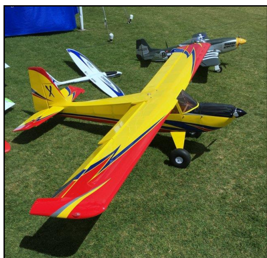
The new Timber ARF from Horizon Hobbies, 110+ wing span, electric powered.