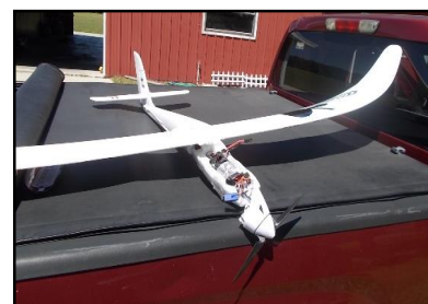
Result of a hard landing!

The Pompano Hill Flyers held their Spring event at our OWLS field on April 27th and 28th. The weather was just about as perfect as possible. On their first event day they had 15 registered flyers with more arriving throughout the day. It's always fun to see these flyers with their high tech gliders. We look forward to seeing them again later in the year.