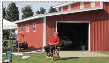
Left: One of several pilots "roughing it" at the Tangerine. Right: One of our OWLS perched on a seat.