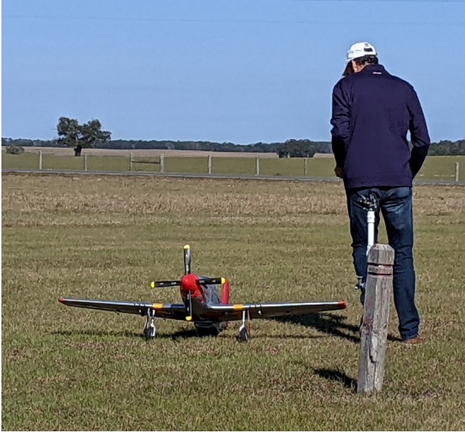
Bert's New P-51 Mustang: